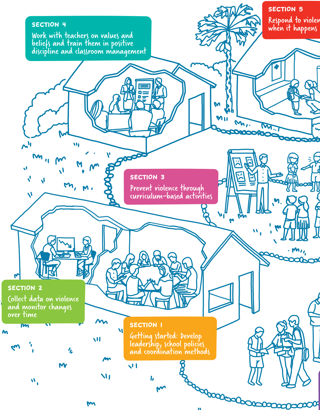
Figure 2: A whole-school approach to violence prevention