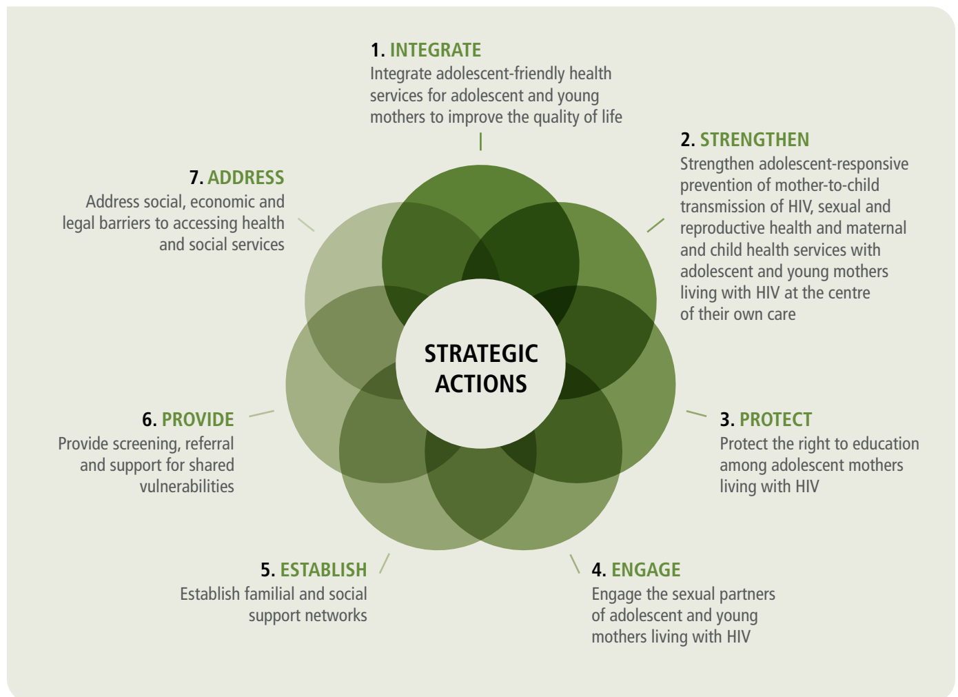
Fig. 1.4. Key strategic actions for improving services for young mothers living with HIV

services, communities, families and adolescent and young mothers are working together to bridge the gap between adolescent- and adult-focused HIV and maternal health services. Whilst outcome data are not as robust in general, the programme examples provided here serve to highlight potential and ongoing lessons in countries.