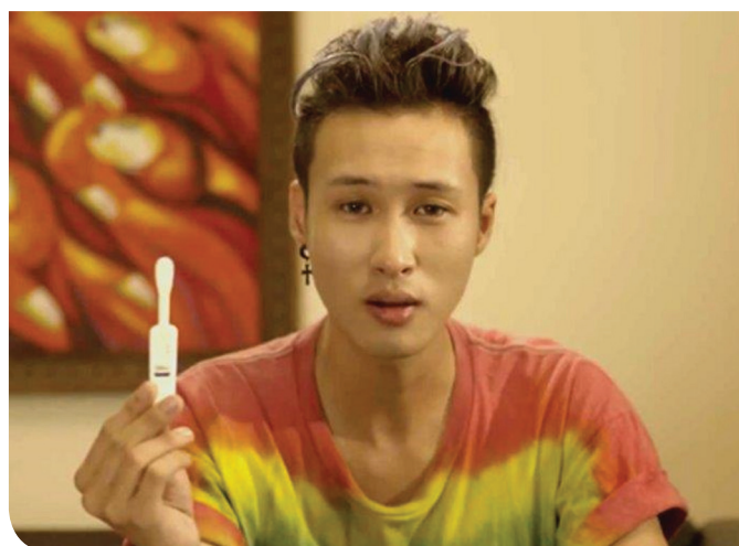
PATH Viet Nam.

For full WHO guidelines on HIV self-testing and partner notification: supplement to consolidated guidelines on HIV testing services see: http://www.who.int/hiv/topics/vct/en/