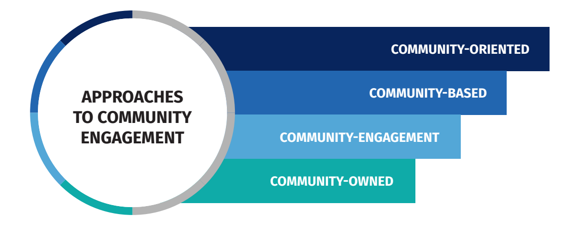
Figure 3 Approaches to community engagement

Each approach is distinct and one is not of a higher order than the other. In selecting an approach, the desired outcome should be the primary consideration. For example, in a measles outbreak, a community-oriented approach is perhaps most appropriate as the objective would be to mobilize parents to have their children vaccinated. On the other hand, in the event of a drought that requires changing of types of crops, a community-owned cooperative for seeds would be more appropriate.