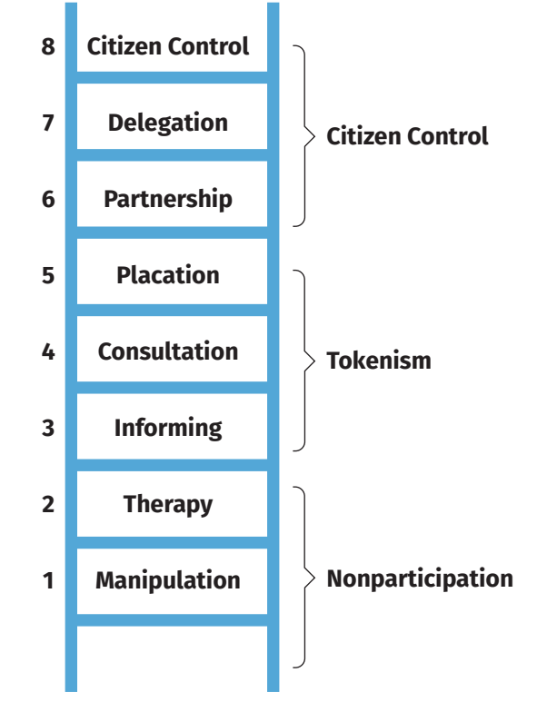
Figure 2 Arnstein's Ladder (1909) Degrees of Citizen Participation