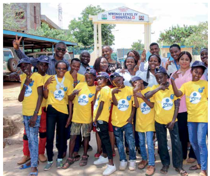
Visitors from CDC and USAID offices join in a group photo with OTZ youth

The principles of adolescent-friendly health services have been clearly outlined (Box 1). In 2015, WHO and UNAIDS translated the principles into eight global standards for quality health-care services for adolescents (30), with each standard reflecting a critical facet of service delivery as well as its criteria. The standards were accompanied by an implementation guide that highlighted necessary steps at the national, district and facility levels to achieve the standards and assessment tools to measure implementation. However, for these key principles and standards to be useful to country HIV programmes, they need to be aligned with clear activities and should be triangulated with HIV-specific considerations (Box 2). Table 1 shows examples of activities that country programmes could consider in attaining each of the standards. These activities need to be linked to results to improve specific outcomes to improve the health of adolescents living with HIV.