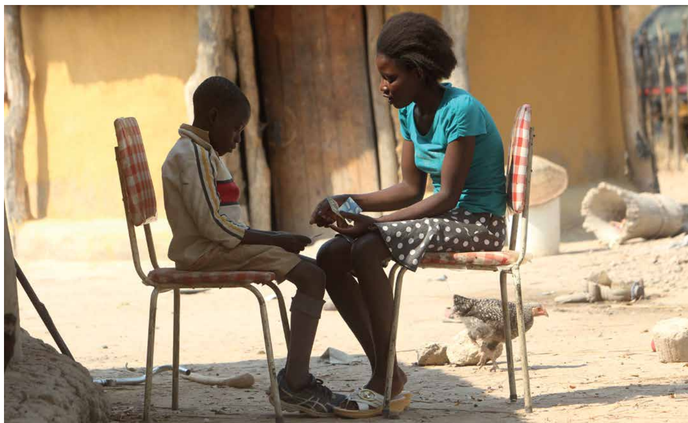
CATS-led adherence counselling during a home visit to a client in rural Zimbabwe

With an increasing number of countries moving towards test and treat all, more people living with HIV are tested and diagnosed and initiate antiretroviral therapy, resulting in an increased number of clients at the health facility level. New developments in service delivery, including differentiated service delivery, show the way forward to responding to the heightened client volume while providing high-quality care with the right intensity and frequency and considering clients' needs and preferences (15).