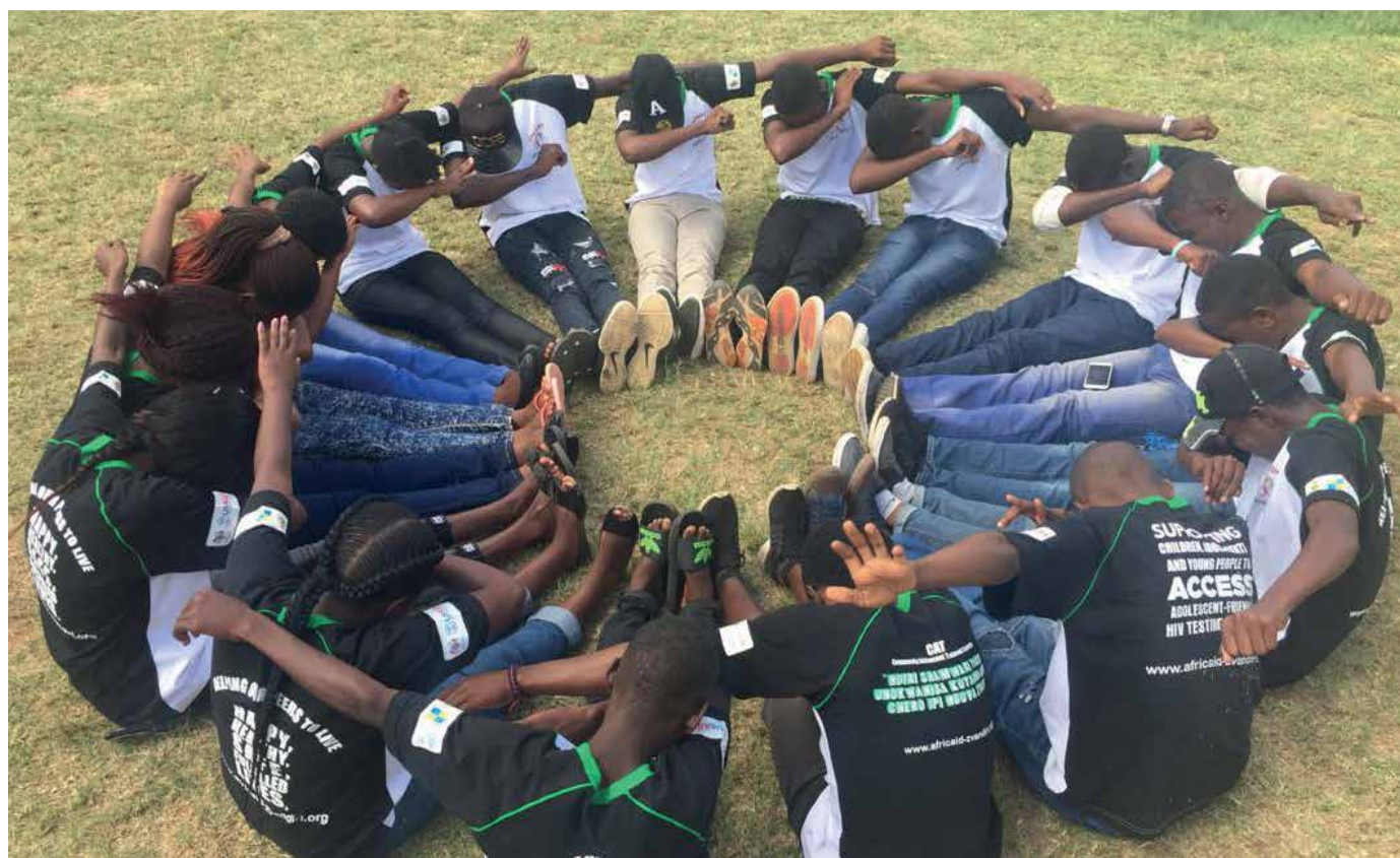
A Zvandiri support group integrated within a facility based ART refill group

The model has been developed in partnership with children, adolescents and young people living with HIV, with the various components of the model being piloted then scaled up progressively over the years in response to the evolving needs of children and adolescents living with HIV in Zimbabwe. In 2014, the Ministry of Health and Child Care adopted Zvandiri as a key component of its national accelerated action plan for HIV treatment for children and adolescents. With funding from PEPFAR, UNICEF and other partners, Zvandiri has been scaled up to 51 of 63 districts, reaching 45,000 CALHIV, with funding from PEPFAR, UNICEF, CIFF, The ELMA Foundation and other partners. It has differentiated further to include disability, mental health, social protection, SRH, and PMTCT services for CAYPLHIV. In 2016, the CATS model began being scaled up in Mozambique, Tanzania and Eswatini under the READY+ programme, led by Frontline AIDS. In 2019, Uganda, Rwanda, Namibia and Ghana have also adopted the model.