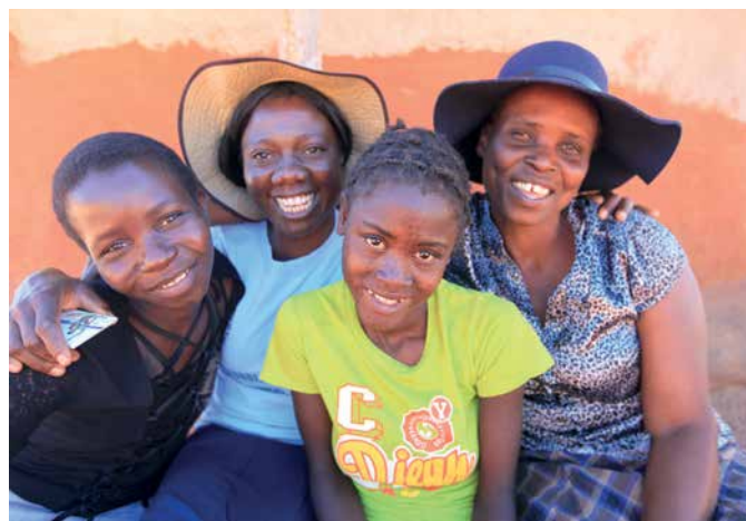
Multi-disciplinary community outreach for enhanced cases - CATS, Community Nurse and Case Care Worker