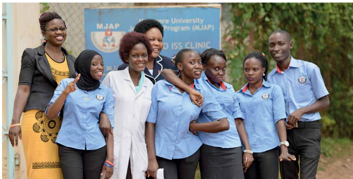
Peer supporters and health providers outside Mulago-Mbarara AIDS Program (MJAP), ISS Clinic in Uganda