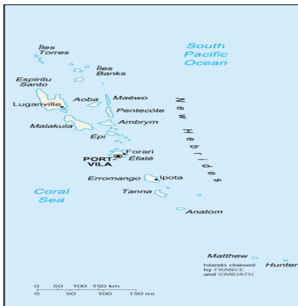
Chart 1: Map of Vanuatu