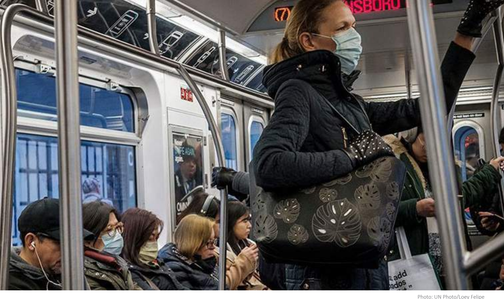
Emerging data including from police, media and human rights organizations reveal that sexual vio lence against women and girls in public spaces continues to occur since the outbreak of COVID 19 in urban,<sup>9</sup> rural<sup>10</sup> and online settings. In Valparaiso, Chile, London, Canada<sup>11</sup>, Nigeria<sup>12</sup>, the Philippines, Kenya, India, and the US, government authorities and/or civil society partners have indicated cases of sexual violence against women in public spaces during the crisis, including some incidences where substance abuse is a facilitating factor<sup>13</sup>.

Several women workers have reported increased sexual harassment as the price they pay for choosing to walk or cycle to work in order to avoid public transport during the pandemic. Women doctors and nurses have also received verbal attacks while in transit in India<sup>14</sup> and Mexico<sup>15</sup>.