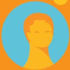
LOUIS BRAILLE invented Braille at 15