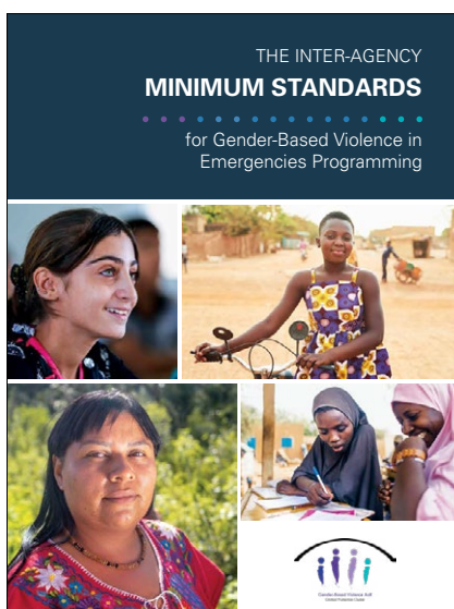
The Inter-Agency Minimum Standards for Gender-Based Violence in Emergencies Programming