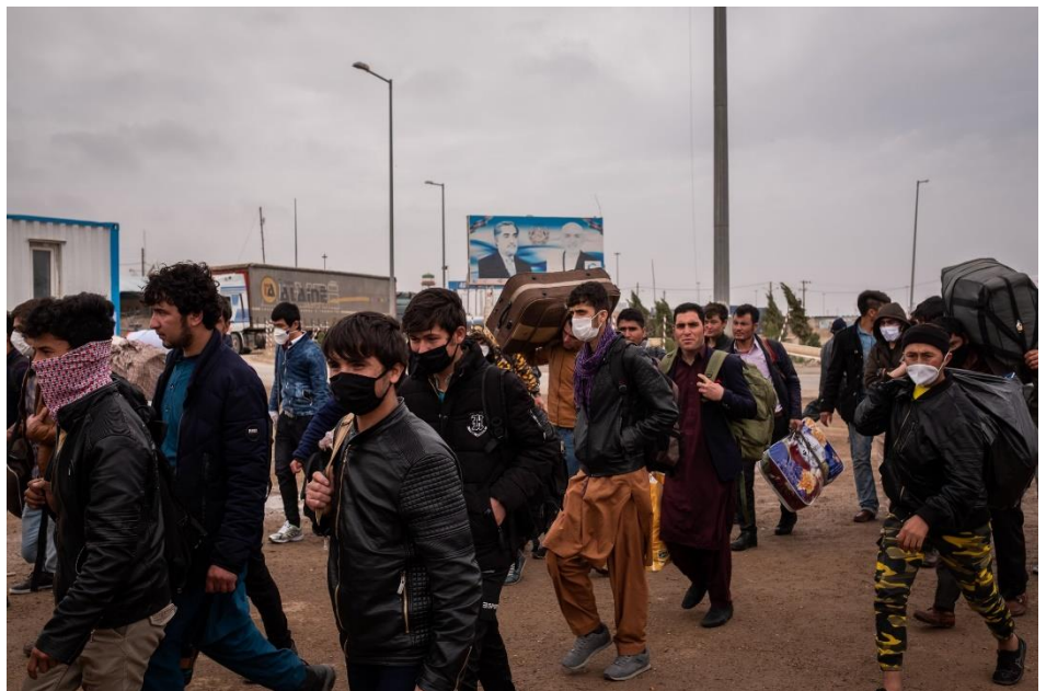
Afghans leaving Iran to Afghanistan

Displaced persons and irregular workers are often excluded from national healthcare systems, except for emergency care, and must pay out-of-pocket to access services ii . This inhibits access to testing and early treatment, thus increasing the likelihood that only the most severe COVID-19 cases are brought to the attention of authorities. Even when covered by the national system, the displaced and migrants still suffer from limited access due to administrative, physical, financial, and language barriers.