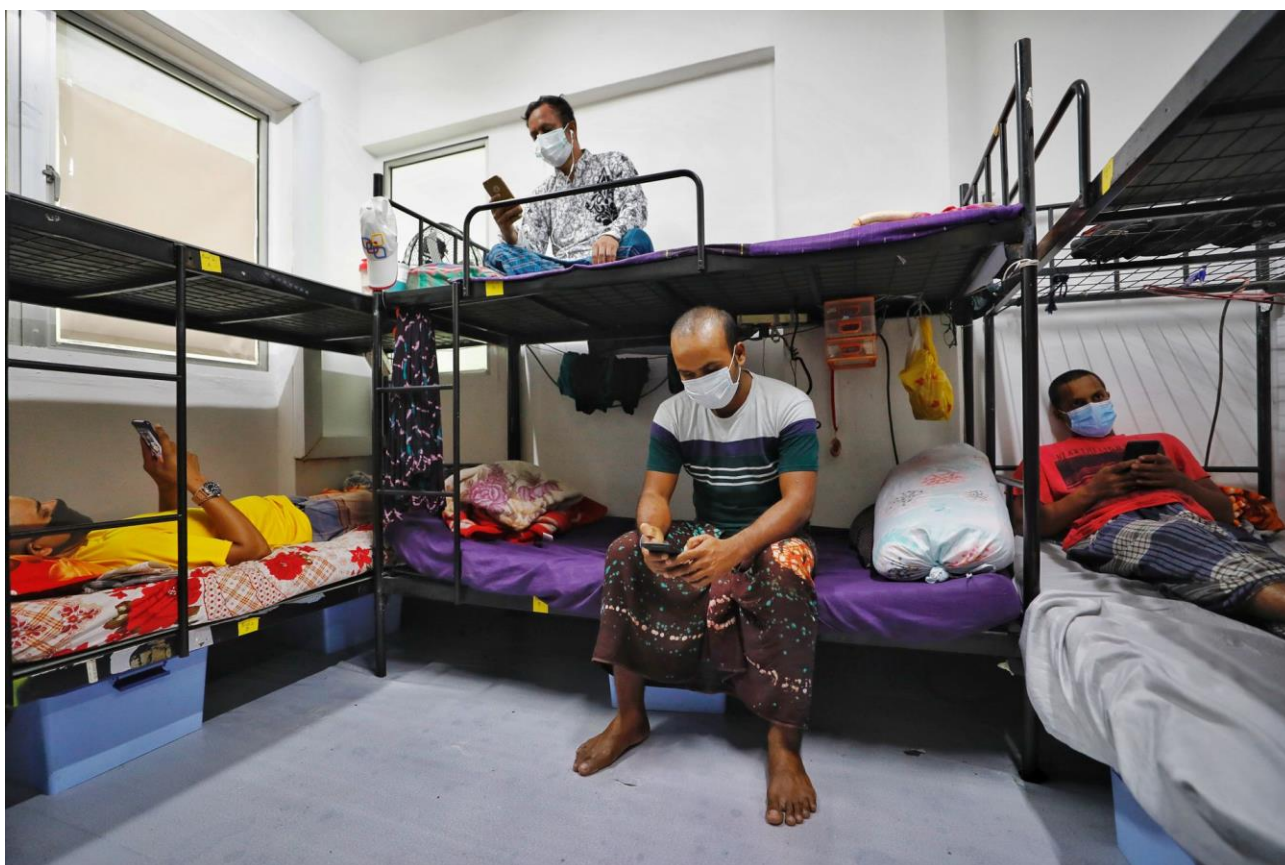
Migrant workers in a dormitory in Singapore

The high vulnerability of migrants and displaced populations to COVID-19, and their susceptibility to experience severe socio-economic impacts, necessitate that their needs are identified and addressed in COVID-19 prevention, response and recovery efforts. If not, this could result in a failure to contain the virus's transmission, mitigate the outbreak's impacts and ensure a resilient recovery.