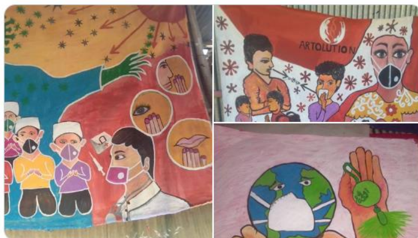
Rohingya artists using their creativity to help refugees protect themselves from COVID-19 through public health messages

Several of the challenges faced by the migrant and displaced communities emanate from their exclusion from formal government care systems. Many work in the informal sector and may be undocumented or lack a legal status. Civil society organizations (CSO) can play a key role in support such migrants by offering outreach, agility, and reach with knowledge of local or minority languages and cultural contexts. CSO and community-based groups and communities themselves can be mobilized to deliver assistance, and support awareness-raising as part of risk communication campaigns. Community health workers can be mobilized to address hotspots of need and migrants returning to their communities can be mobilized to promote preventive public health practices. In India, civil society organizations have stepped up to complement government services by providing relief assistance to migrant workers affected by the lockdown to contain the spread of COVID-19. This is part of an outreach effort by the Government of India to over 92,000 NGOs to assist state and district governments respond to the needs of the migrant workers. x In addition, CSOs may be well-positioned to identify migrants and displaced populations that can contribute to the COVID-19 response, ensuring their unique capacities are harnessed to support communities.