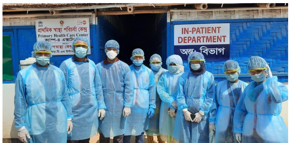
Frontline healthcare workers in the Rohingya refugee settlements

The COVID-19 response poses specific challenges to humanitarian and health workers in refugee camps and settlements. Assisting displaced communities may put humanitarian workers at risk of exposure to COVID-19. Travel restrictions and the closure of borders impede the movement of staff and supplies. In some settings, humanitarian workers also have to fight against the dual challenge of conflict and the pandemic.