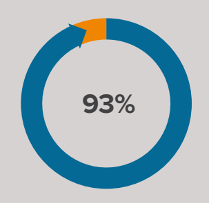
People living with HIV who know their status<sup>2</sup>