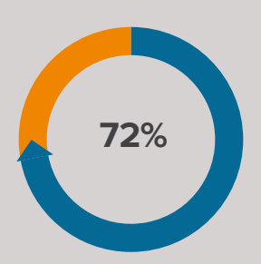
People living with HIV with supressed viral load<sup>3</sup>