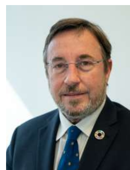
Achim Steiner, Administrator, United Nations Development Programme (UNDP)

I invite you to read the strategy and learn more. With the support and collaboration of our partners from the UN family -- including our close partnership with UN Women -- and beyond, UNDP will continue to take action with countries and communities to expand people's choices and realize a just and more equal world.