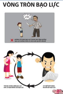
Source: Swanton B. The Love Journey: Good practices in curriculum adaptation. Presentation at 2013 Asia-Pacific Roundtable on School-Related Gender-Based Violence, Bangkok, Thailand.

Finally, SRGBV programmes in the region addressing sexual violence and abuse in schools appear to primarily focus on working with teachers to prevent sexual violence and abuse and rarely with students to guide them on how to protect themselves from abuse, understand their rights, and be aware of legal support or child protection mechanisms to which they have recourse in the case of abuse or harassment. Further, these programmes tend to be gender-blind, and often see children as genderless. In terms of sexual violence, this blindness stems from multiple issues, including stereotypes that men and boys are perpetrators and never victims, taboos around girls’ sexuality and sexual activity, and deep-rooted discomfort in discussing homosexual contact (whether consensual or coerced). 237 SRGBV programmes in the region do not sufficiently examine incidents of school-related violence through a gender lens. Moreover, programmes addressing sexual violence and abuse against boys in schools are very rare or inadequately incorporated into school efforts to prevent and mitigate sexual violence.