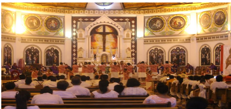
WAD 2015 mass at Mulivai Cathedral