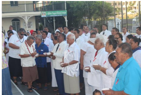
Support from our local politicians and church ministers and others – WAD Mass