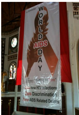
World AIDS Day 2015 Banner

MOH launched multiple media campaigns during the following week. This included multiple radio and TV spots as well as an airing of the documentary “E te silafia”, which described the status of the HIV/AIDS epidemic in Samoa on national television.