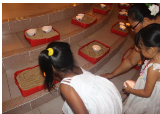
Participants in the WAD Mass candle ceremony