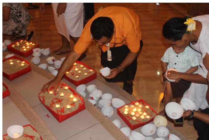
Participants lighting candles for those who have died from AIDS at the WAD mass