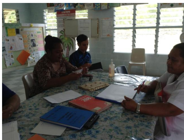
HIV/STI/TB program staff during an M&E visit to Savai'i hospitals

became more involved, due to the evaluation of the Presumptive Treatment for Chlamydia Protocol that was implemented in May 2015. Since Chlamydia has been very prevalent and a persistent sexual health issue, data regarding its effectiveness, coverage and impact was of priority interest to the MoH. Ensuring the collection of this data, also improved the data collected on other performance indicators. Monitoring visits also provided MoH an opportunity to informally assess facility maintenance and quality of service delivery. This helped inform reporting and oversight of the health sector. MoH staff also made assessments of each facility's data systems so as to inform the development of the electronic M&E tool and the M&E manual.