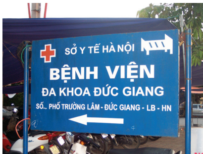
Vietnam Duc Giang General Hospital