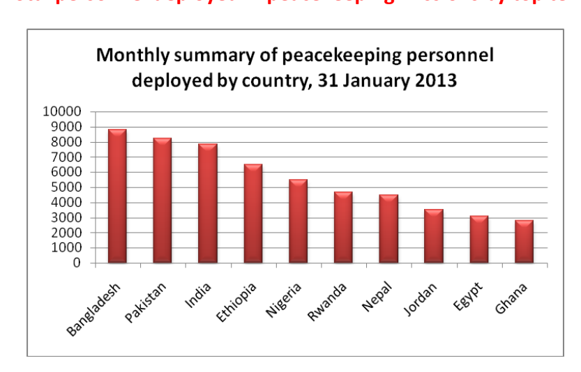
Figure 1: Total personnel deployed in peacekeeping missions by top ten countries

To address the specific problem of GBV in conflict and post-conflict situations the UNSC has adopted a series of resolutions. For example, United Nations Security Council Resolution 1325 on women, peace and security recognises the impact of armed conflicts on women and girls, in particular it called on member states to incorporate HIV awareness training into their national training programmes for military and civilian personnel before deployment. Also, Resolution 1820 on Women, Peace and Security adopted in June 2008 is of particular relevance to Asia and the Pacific region. It urges troop and police contributing countries to take appropriate preventative actions to strengthen efforts to implement the policy of zero tolerance of sexual exploitation and abuse in UN peacekeeping operations and military sexual trauma among their personnel as a way of reducing HIV risk (S/RES/1820: 7). Over a quarter (27%) of total personnel deployed in peacekeeping missions comes from Bangladesh, Pakistan and India. These countries, along with Nepal are in the top ten troop and police contributing countries (see Figure 1). Of the police deployed, Bangladesh contributed 14% of the total. Bangladesh contributed 14% of the total.