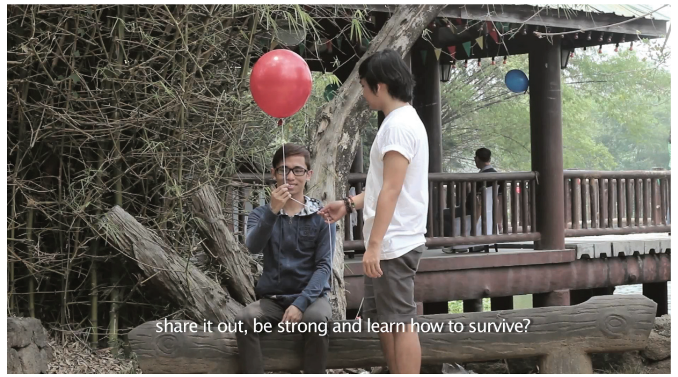
Capture from "Loud and Proud" Campaign's video (The Philippines's part) http://youtu.be/IV2-JL5m6Ck

Capture from "Loud and Proud" Campaign's video (Mongolia's part) http://youtu.be/IV2-JL5m6Ck