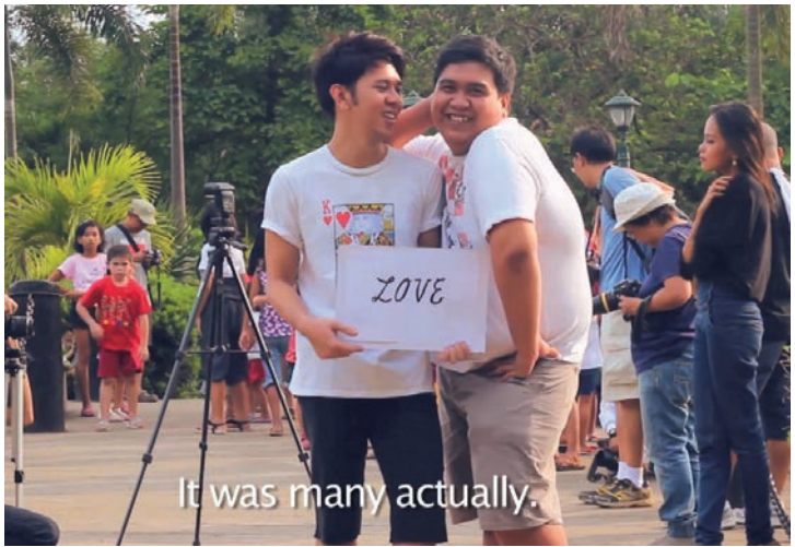
Capture from "Loud and Proud" Campaign's video (The Philippines's part) http://youtu.be/IV2-JL5m6Ck

Young MSM and transgender women need HIV, health and other interventions that take into consideration their fears and doubts about the future. If young MSM & TG have education and livelihood opportunities, they may be more likely to have improved self-esteem and fewer self-issues. If interventions address public attitudes and the often broken legal and justice systems, young MSM and TG may be more likely to grow-up in a safe environment.