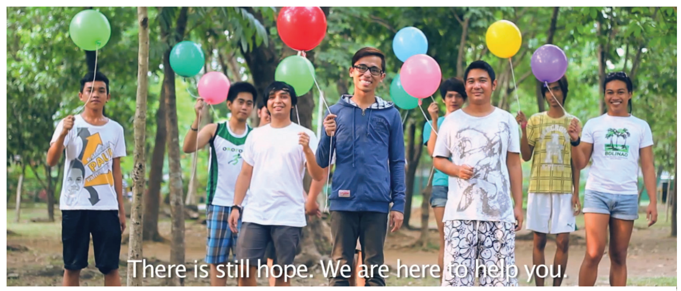
Capture from "Loud and Proud" Campaign's video (The Philippines's part) http://youtu.be/IV2-JL5m6Ck