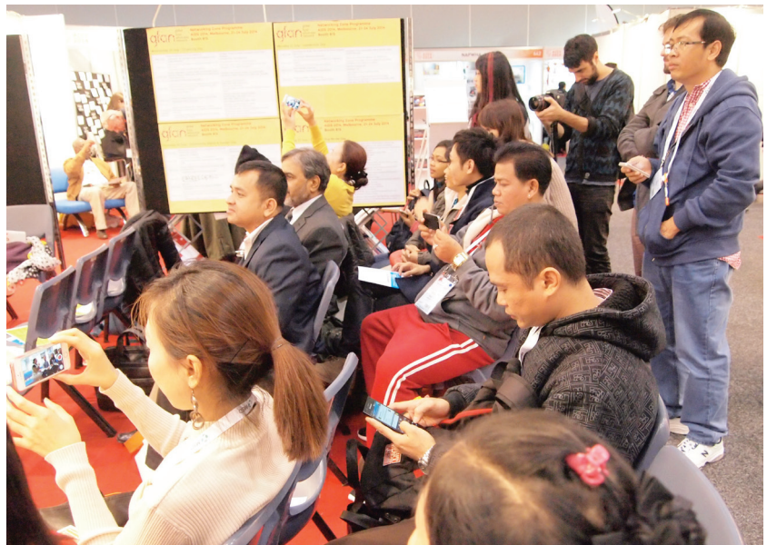
Participants from Asia and the Pacific discuss the crucial community involvement in the country dialogues at the Global Fund Advocates Networking Zone at AIDS 2014, Melbourne, Australia.