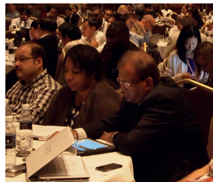
Participants at the Global Fund South and East Asia Workshop “Achieving Impact: The New Funding Model Update”, 16-18 June 2014, Phnom Penh, Cambodia.

Once approved, grants will begin to be implemented for an implementation period of 3 years.