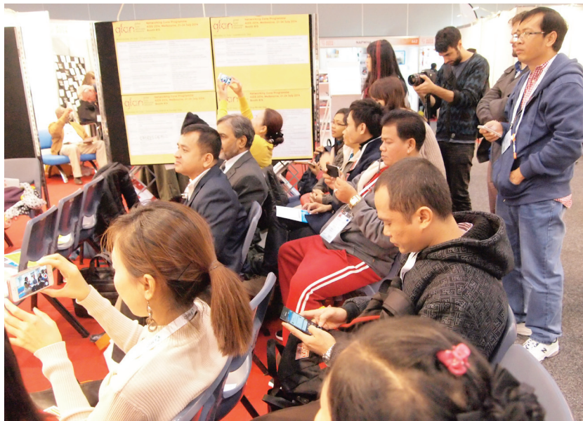
Participants from Asia and the Pacific discuss the crucial community involvement in the country dialogues at the Global Fund Advocates Networking Zone at AIDS 2014, Melbourne, Australia.