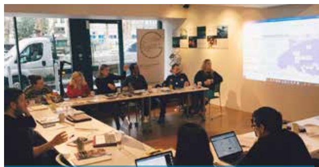
Kick-off meeting of the Harm Reduction Consortium, January 2019, London