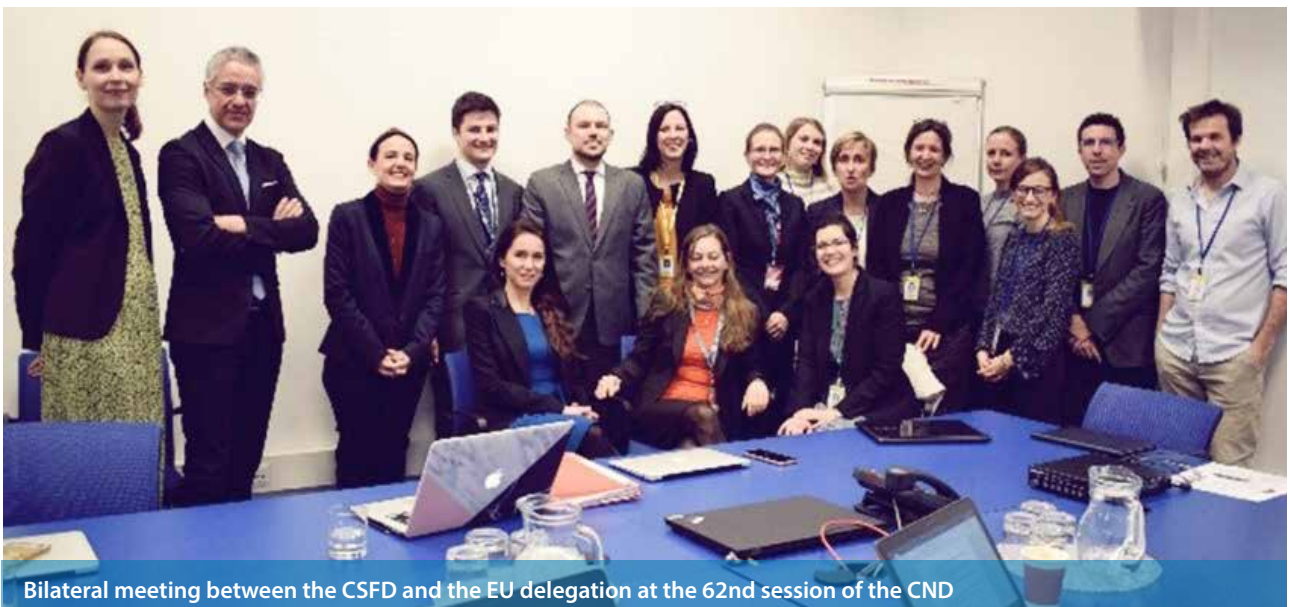
Bilateral meeting between the CSFD and the EU delegation at the 62 nd session of the CND

The 62 nd session of the CND was particularly important for the reform movement as UN member states met to take stock of the past ten years of global drug control and define what would come next. Unsurprisingly, almost 500 NGOs were in attendance at the CND and its Ministerial Segment held from 14 th to 22 nd March 2019.