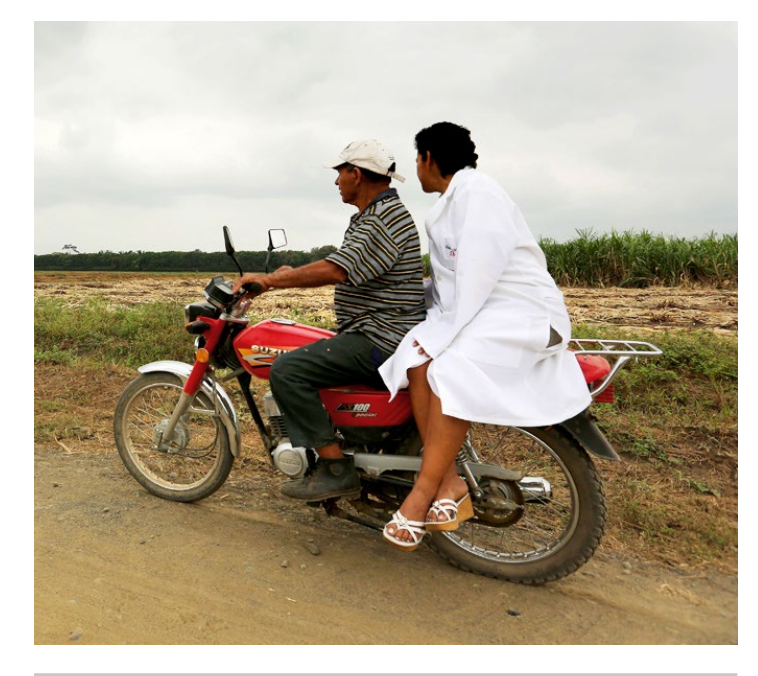
Health promoters travel by foot, by canoe or by motorcycle to reach communities, Ecuador.

Universal access The United Nations and governments agreed to scale up HIV prevention, care, support, and treatment with the goal of achieving universal access to these services for all those who need them by 2010.