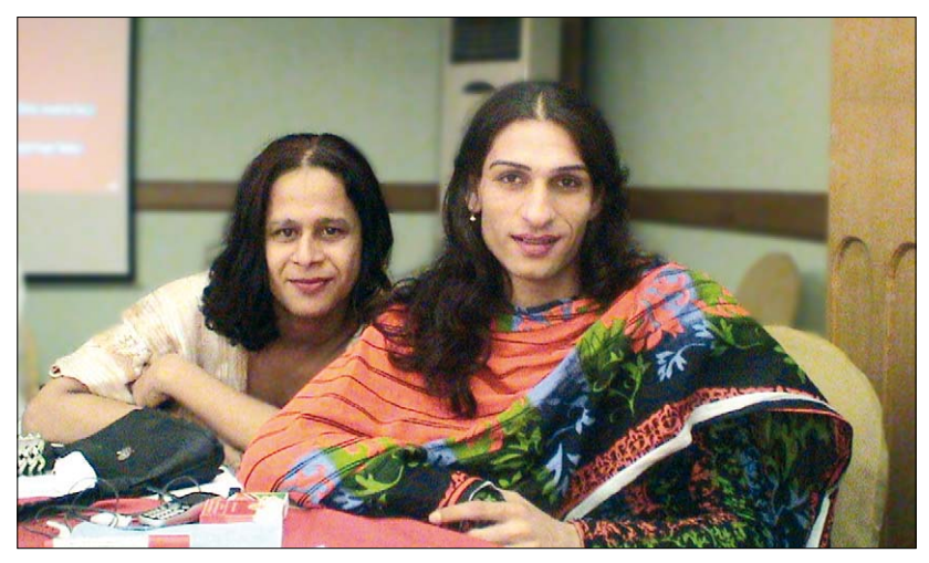
Figure 3: Male sex workers in Pakistan

Overall, a notable prevalence of STIs—eg, syphilis, hepatitis B, hepatitis C, and HIV—has been noted among men who have sex with men.<sup>25</sup> Epidemiological studies from sub-Saharan Africa, Europe, and North America have suggested that the presence of a pre-existing STI increases the risk of getting infected with HIV four-fold.<sup>27</sup> In Pakistan, the national estimate of HIV prevalence is 64 per 100 000 population. Among patients with STIs, the seroprevalence of HIV may be as high as 6100 per 100 000.<sup>28</sup> A study on men with STIs in Pakistan reports that, of the 465 men studied, 55% acquired the STI