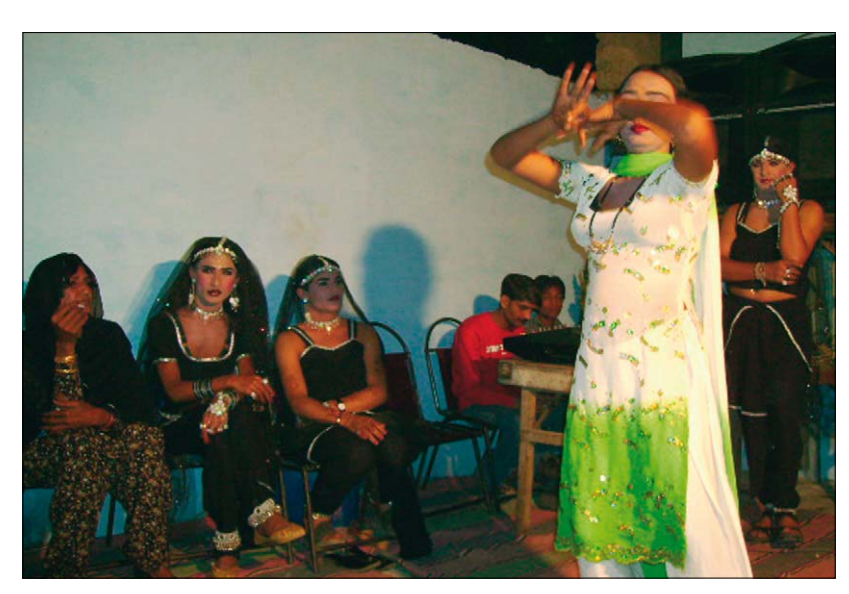
Figure 2: A network among hijras and zenanas helps them communicate with and cater to their clients in private houses

that all extramarital sex is forbidden by Islam, one would suppose that the fear of God in itself would be enough to discourage illicit sex among men who have sex with men. Unfortunately, the moral approach serves only to drive the behaviour underground. 11.12 An alternative approach is to create awareness among men who have sex with men about the increased risk of HIV infection by promiscuity and unprotected anal sex, and to educate this vulnerable population about safe sex. In a Muslim state, however, promoting safe sex is viewed as the equivalent of promoting sex. This places our policy makers in a quandary—prevention strategies need to be implemented without implying violation of the religious codes.