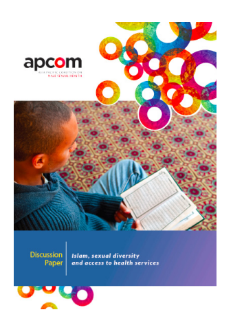
Discussion Paper: Islam, Sexual Diversity and Access to Health Services

"I believe that Christianity is still the main institution from which discrimination and stigmatisation of MSM and TG people stems" HIV-Positive MSM Activist, Tonga