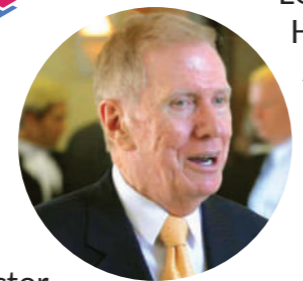
LGBTI Human Rights Ambassador The Hon Michael Kirby