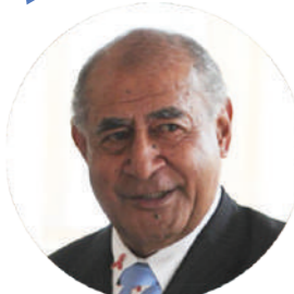
Pacific Ambassador H.E. Ratu Epeli Nailatikau